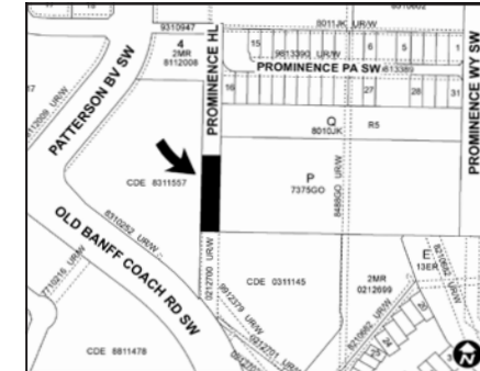
PLAN 1313149, AREA A