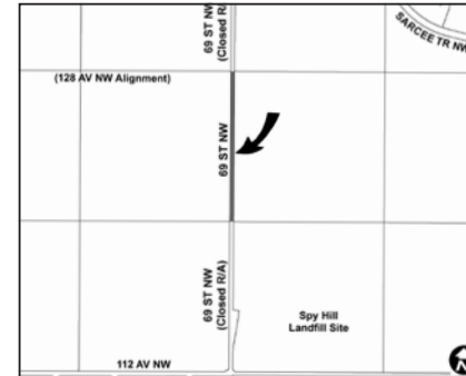
PLAN 1313107, AREA A